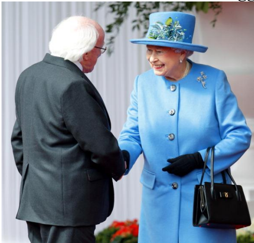
HM The Queen welcomes President Michael D Higgins at the Datchet Road