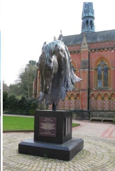
Copenhagen and Chapel