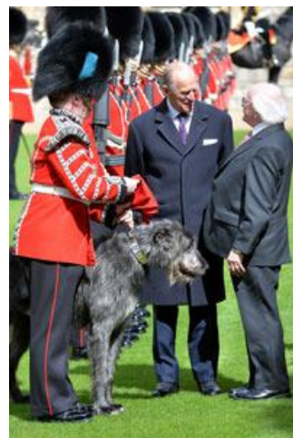
President Higgins presents a new ceremonial coat to Domhnall, the Irish wolfhound, and mascot of the Irish Guard