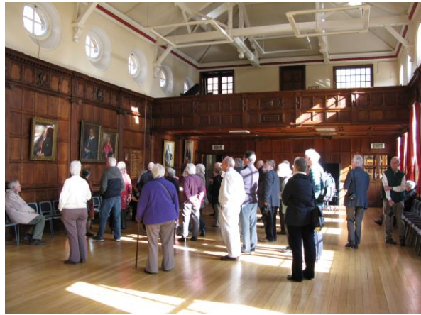
The Old Hall