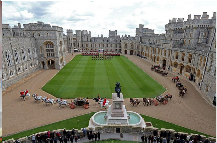
Arrival of the state coaches at Windsor Castle