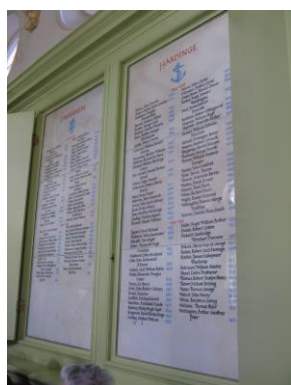
Rolls of Fallen

awarded the prestigious medal – second only in number to Eton. The 1999 film of An Ideal Husband used Old Hall as the setting of the Women's Liberal Association meeting.