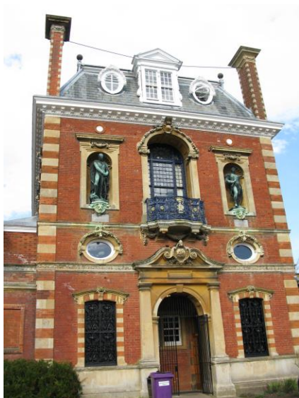
The South Front