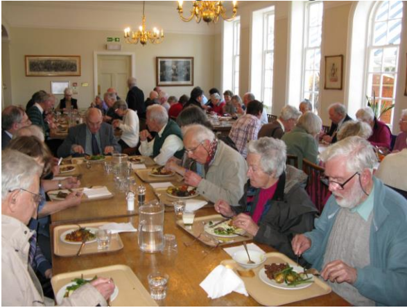
Members at lunch