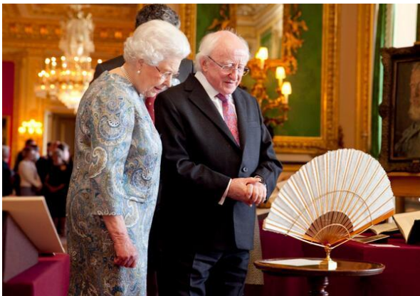
More Irish treasures in the Collection