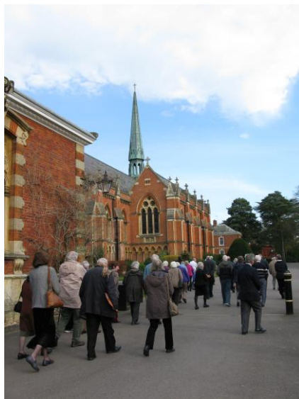
To the Chapel