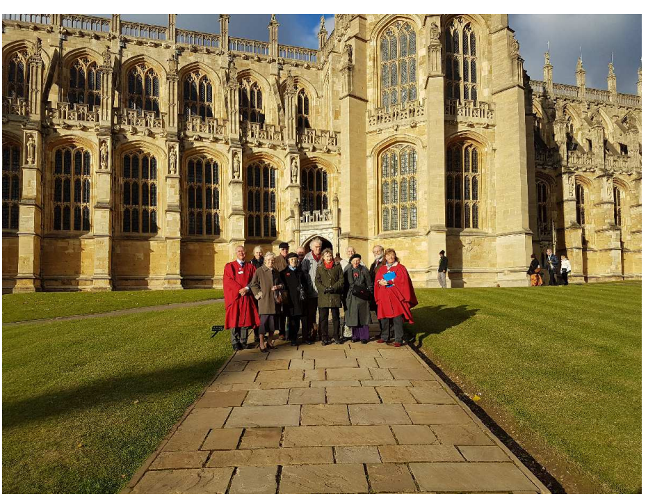
The BLHA Group at St George's Chapel

At the end of the afternoon, I felt privileged to have experienced