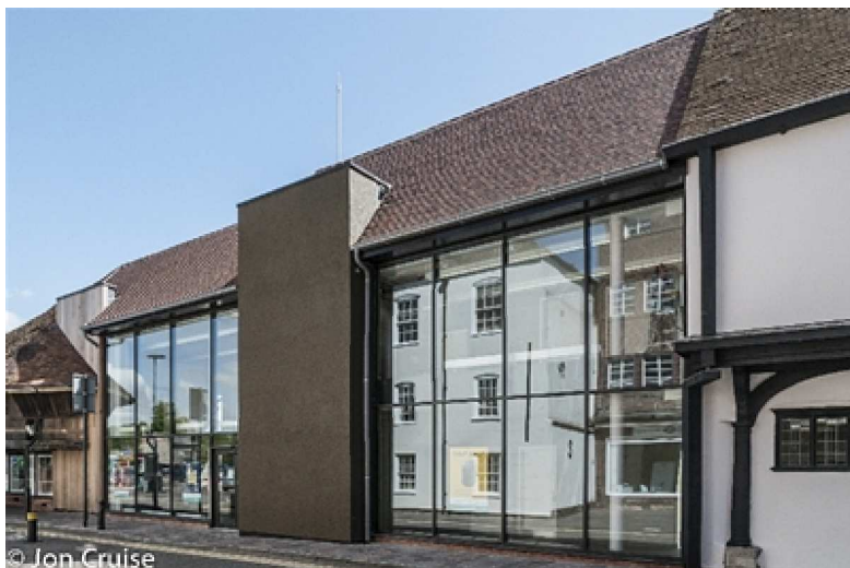
The new face of the museum

new Story Stores are planned to be changed regularly so every few months so the collections will be used to their full potential. Alongside this museum staff have also been developing and trialling learning opportunities with local schools that will be provided within the new museum.