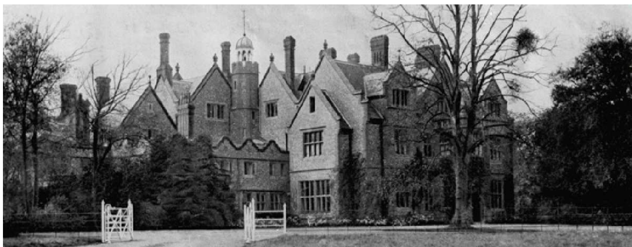
Holme Park, Sonning. Once the site of the Bishop of Sarum's Berkshire Palace and later home to the Palmer family

Eventually, in 1660, the school established itself as the Aldworth Hospital Charity School in the former Talbot Tavern in Silver Street, Reading where the curriculum was reading, writing, arithmetic and religious instruction; on Sundays the boys would attend a service at St.Laurence's Church, this tradition continued until 1946. The boys were required to wear a uniform of blue gown, yellow stockings and buckled shoes; traditionally blue was the colour of charity. The school continued to benefit from donations from local worthies; Thomas Rich of Sonning gave £6,000 in 1666, ironically, the school would move to his family seat in 1947.